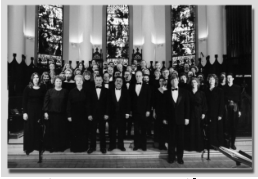
San Francisco Lyric Chorus